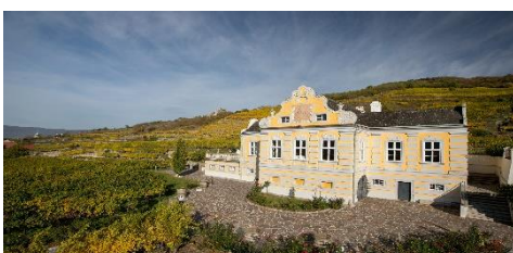
BAROQUE CELLAR PALACE

Alcohol: 12,5 % | Acidity: 7,4 ‰ | Residual Sugar: 1,7 g/l