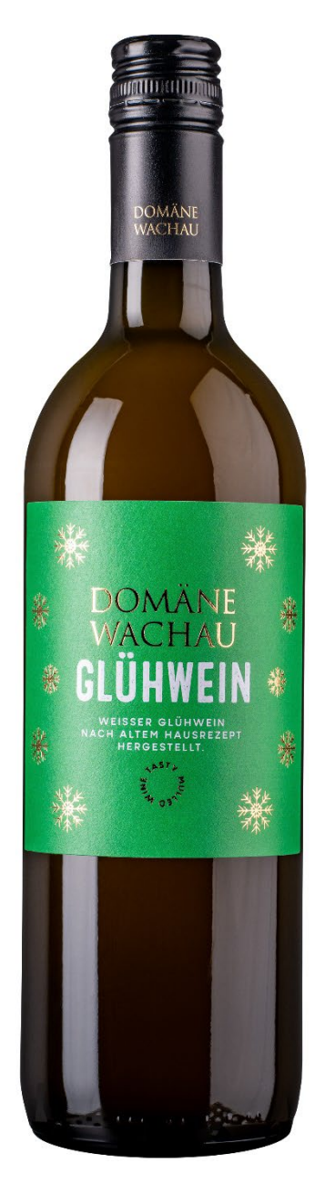
Alkohol: 9.5 %

Shake well before opening. Ready to drink; simply heat and enjoy. Do not boil.